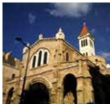
ST LOUIS CAPUCHIN CHURCH Capuchin Street