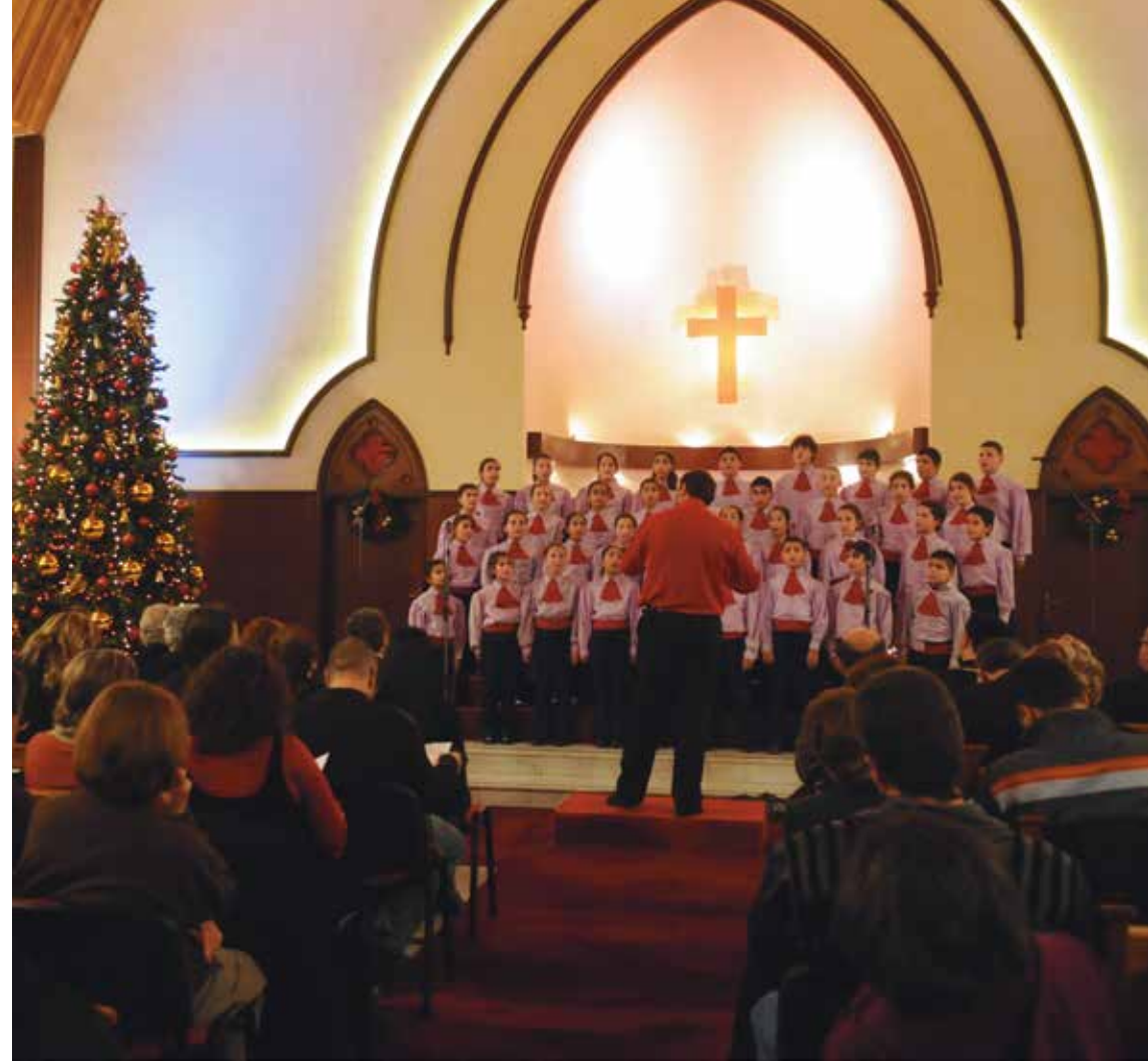
Gargatch Children's Choir | Beirut Chants Festival 2011