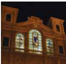
ST GEORGES MARONITE CATHEDRAL Amir Bachir Street