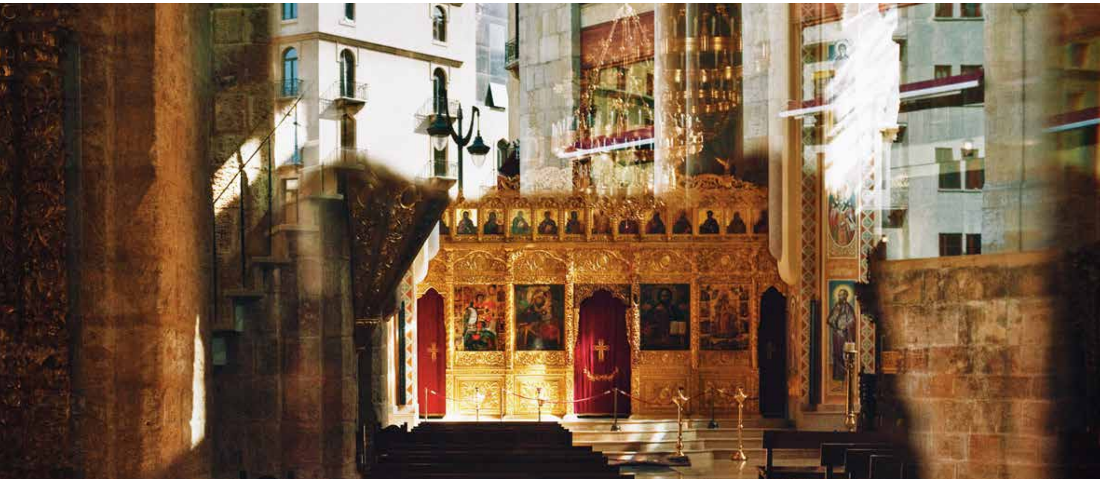
St Georges Orthodox Cathedral | Beirut | 2010