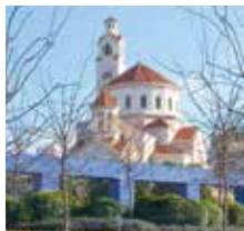
ARMENIAN CATHOLIC CATHEDRAL Saifi