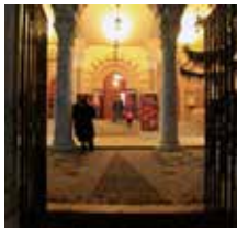
ST MARON GEMMAYZEH Georges Haddad Street