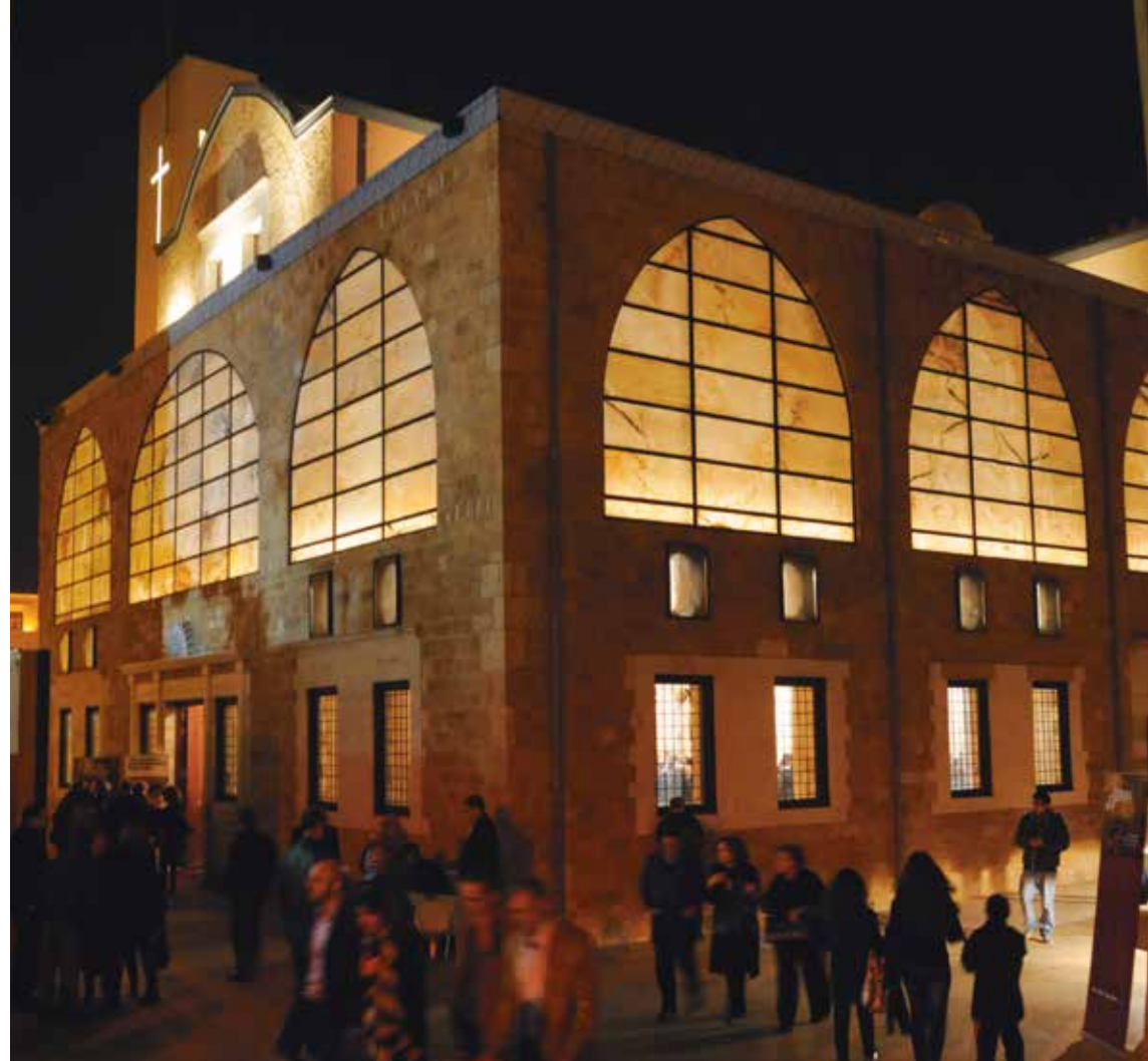
St Elie Greek Catholic Cathedral | Beirut Chants Festival | 2010