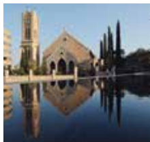
NATIONAL EVANGELICAL CHURCH National Evangelical Street