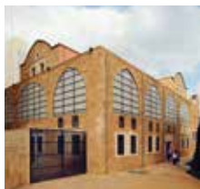
ST ELIE GREEK CATHOLIC CATHEDRAL Nejmeh Square