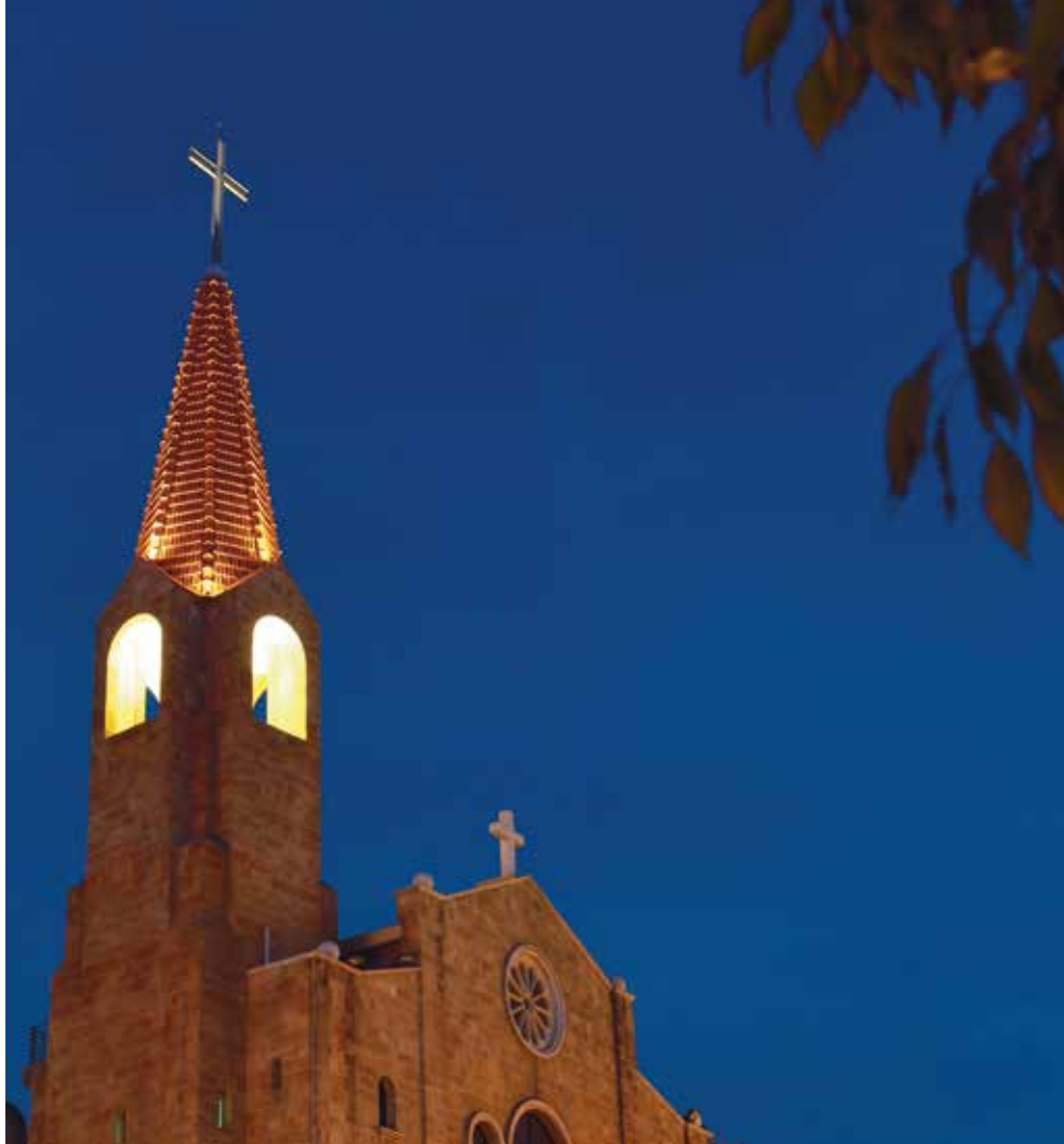
St Elie Kantari | Beirut | Photo Mosbah Assi | 2012