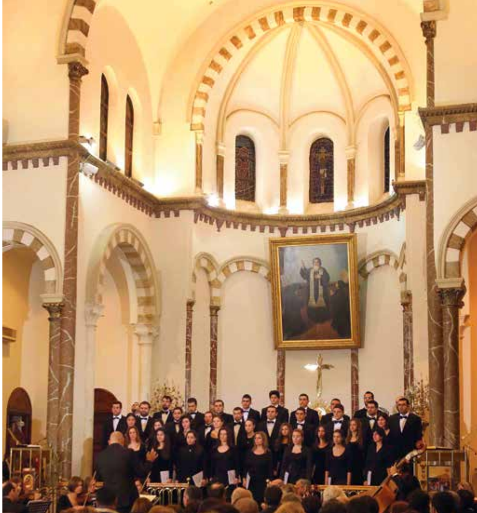
Antonine University Choir | Beirut Chants Festival 2011 | Photo Mosbah Assi | 2011