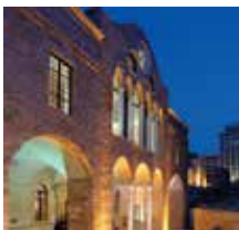
ST GEORGES ORTHODOX CATHEDRAL Nejmeh Square