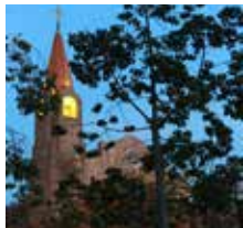
ST ELIE KANTARI Fakhreddine Street