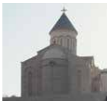
ST NICHAN CHURCH Grand Serail Hill