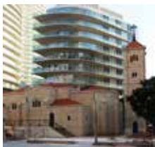
ALL SAINTS CHURCH Ahmad Chawki Street