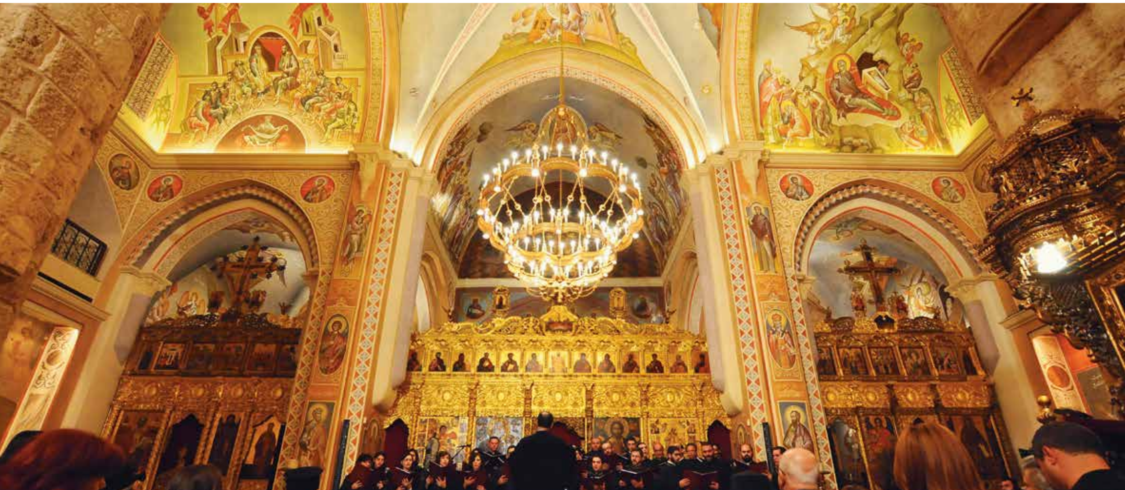
St Romanos Choir | Beirut Chants Festival 2010 | Photo Mazen Jannoun | 2010